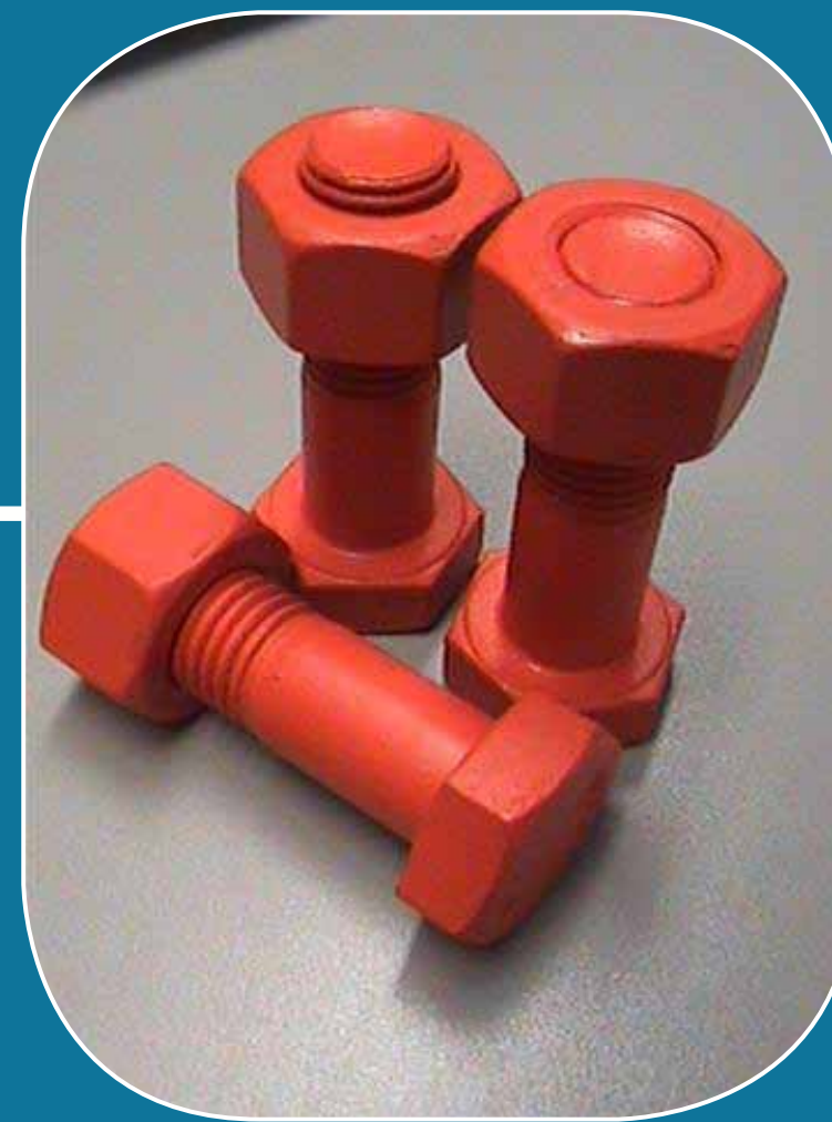
Fastener blasting and xylan coating