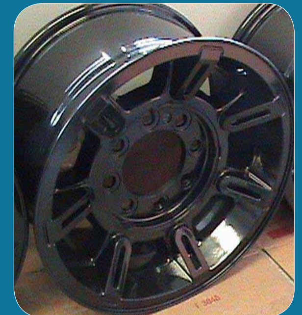
Motor bike wheel rim powder coating