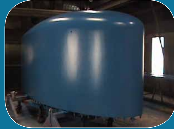
Ship's sonar dome blasting and painting