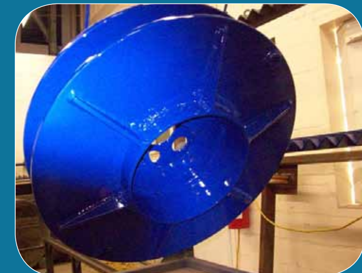
Crane structure powder coating