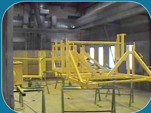
Structural frame and tube blasting and painting