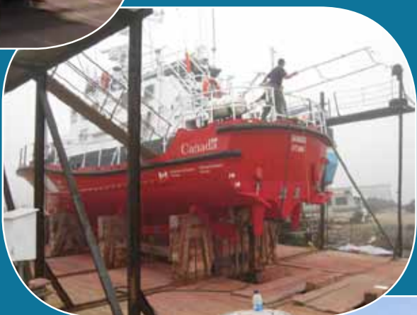
Coast guard boat fully painted exterior only