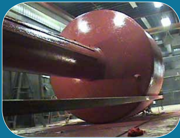
Buoy blasting and painting