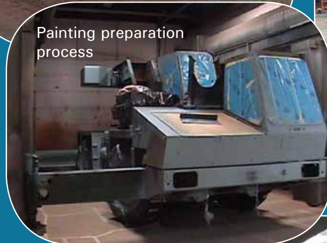
Painting preparation process