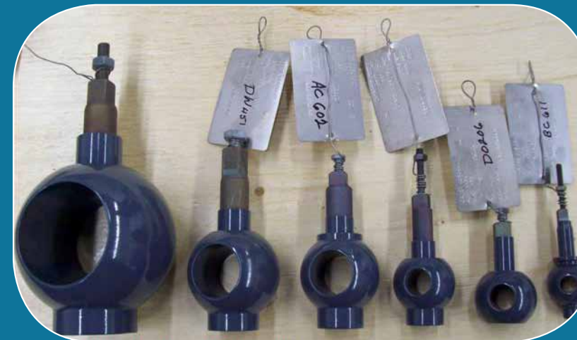
DND valves blasting and coating with xylan