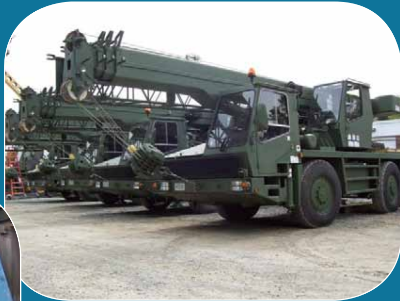
DND mobile crane 25 ton fully painted ready to go